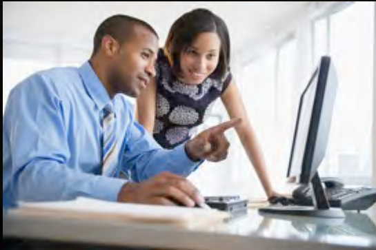
Career & Technical Opportunities

The Marine For Life Network can guide your search for: