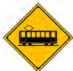
Streetcar Crossing Ahead