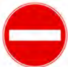
No Entry (Do Not Enter)