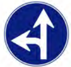
Straight or Left Turn Only