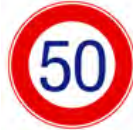
Maximum Speed Limit (50 KPH)