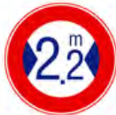
Maximum Width (2.2 m)