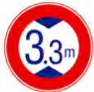
Maximum Height (3.3m)