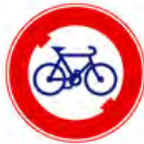
Road Closed to Bicycles