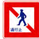
Road Closed to Pedestrians