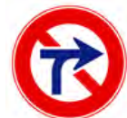
No Right Turn