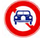
Road Closed to All Vehicles Except Motorcycles