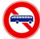
Road Closed to Large Passenger Vehicles