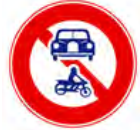
Road Closed to Motor Vehicles