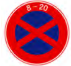
No Parking or Stopping