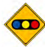
Traffic Signal Ahead