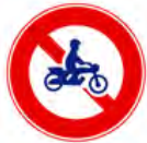
Road Closed to Motorcycles and Mopeds