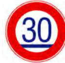
Minimum Speed Limit (30 KPH)