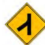
Merging Traffic Ahead