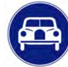
Motor Vehicles Only