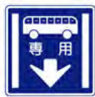
Exclusive Lane for Buses