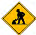
Roadwork Construction Ahead