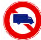
Road Closed to Large Trucks