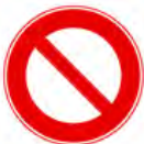
Road Closed to All Vehicles