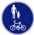
Bicycles and Pedestrians Only