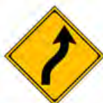
Right Double Curve