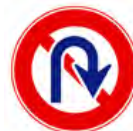
No "U" Turns