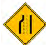
Fewer Lanes Ahead