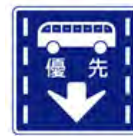
Priority Lane for Buses