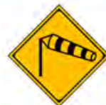
Caution Side Winds